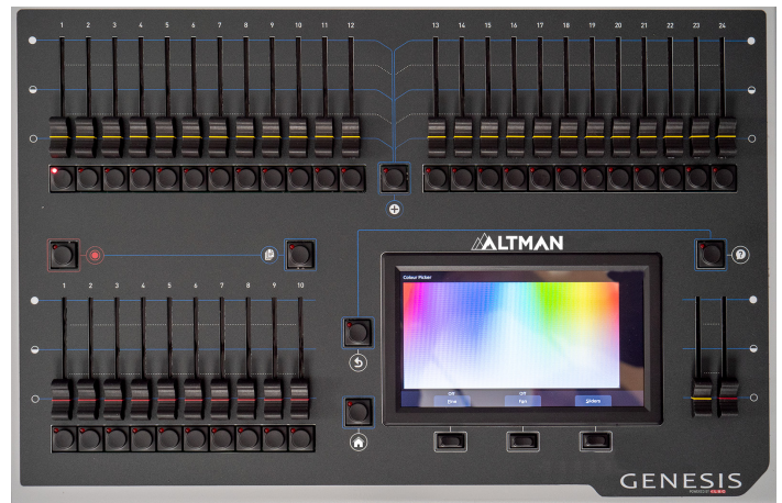
Genesis Control Console